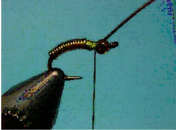
Photo # 3 Make tight spiral wraps, edge to edge, of the brass wire to 1/8" from the bead. Tie off the wire with the thread. Trim off the excess wire.