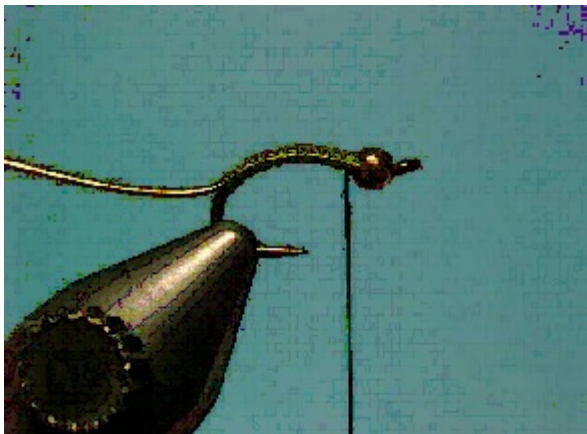
Photo # 2 Tuck the end of the wire under the head of the bead. Tie in the wire along the hook shank to halfway point of the bend. Bring your thread back to 1/8" from the bead.

Photo # 1 Slide a bead on the hook to behind the eye. Tie in the thread. Wind it to the halfway point of the bend and then bring it back to the bead.