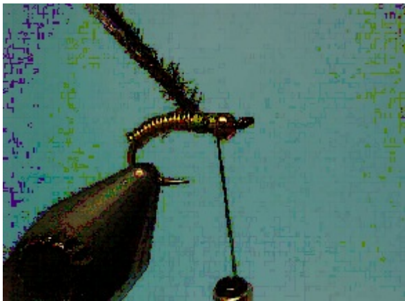
Photo # 4 Tie in two or three Peacock Herls at the brass wire. Spiral wrap the peacock herl to form a collar. Tie off, and trim the excess peacock herl. Whip finish the thread at the tie off point at the collar behind the bead. Add head cement to the thread to make it secure.

This nymph resembles a Chironomid larva, midge or a case building Caddis larva. It fishes deep due to it's weight. Try fishing it as a dropper on a larger fly or under an indicator.